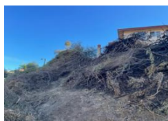
Acacia after fire

VCFD recommends removing any hazardous vegetation such as Junipers, Italian Cypress, and Acacia.